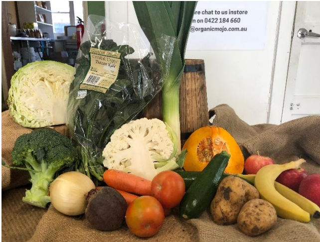
Small box $30