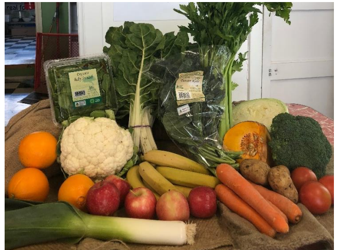
Large box $60

Our fruit and veggie boxes have been such a success we are moving to monthly orders!