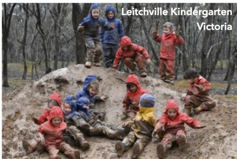
Leitchville Kindergarten Victoria