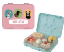
PERSONALISED BENTO BOXES