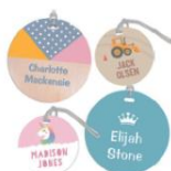
PERSONALISED BAG TAGS