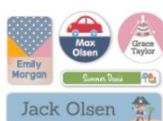
PERSONALISED NAME LABELS