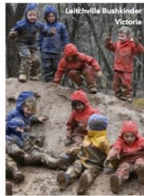
Leitchville Bushkinders Victoria