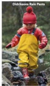
Didriksons Rain Pants