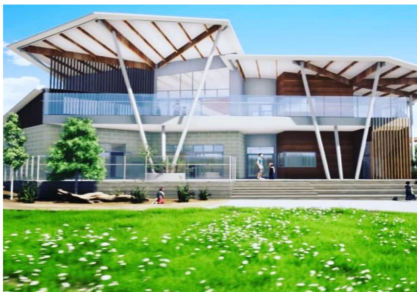
An artist's impression of Stage 2 – on track for completion mid-September. More landscaping to be completed in the following months.