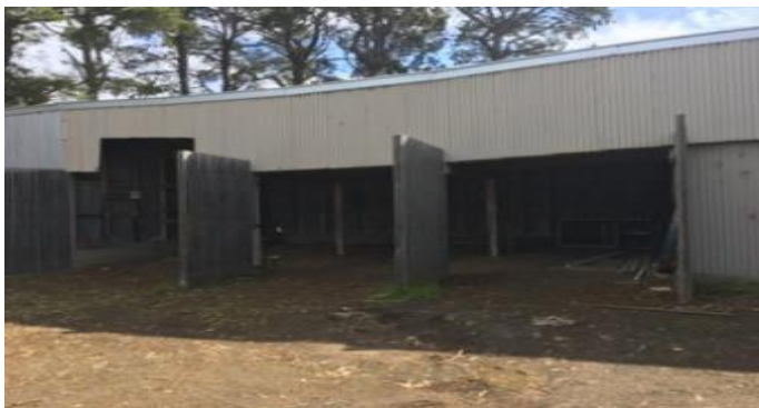
Early images of the outdoor space.