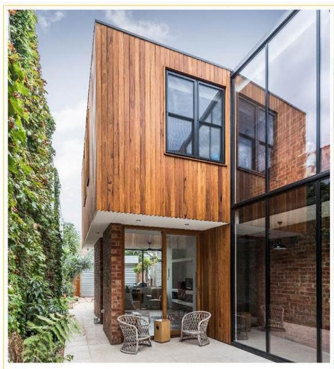
With over 30 years experience in project delivery, we can help you through the full design journey and help to see your project realised successfully.