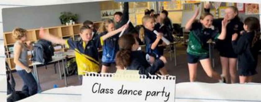
Class dance party