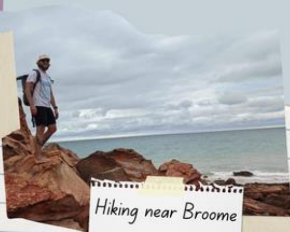
Hiking near Broome